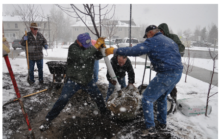
Arbor Day tree planting, April 2012

THE CLUB WELCOMES EVERYONE TO JOIN IN ALL ASPECTS OF THE CLUB'S ACTIVITIES.